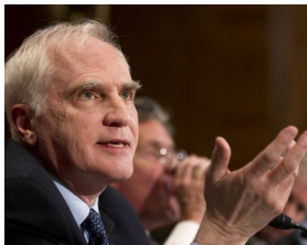
Fed lays out tougher capital rules for foreign banks