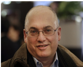
SEC preparing lawsuit against SAC hedge fund