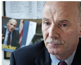
Here comes another special election for D.C. Council